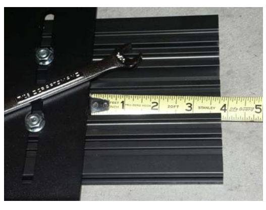
Attach C-B43 transmission hump bracket to 18" section of extrusion using (4) 1/4" x 3/4" bolts and serrated nuts. (7/16" Wrench)